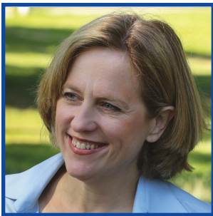
MELINDA KATZ PRESIDENT